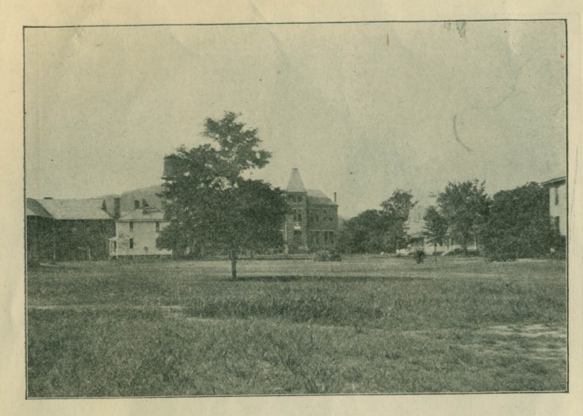
A View of the Campus

The poet sings of Columbia, Great school in a greater state, Of the rich and proud, whose praises loud Her glories do relate. But we will make the welkin ring On timbrel, harp and lute With echoes for the school we name, Our own dear Institute.