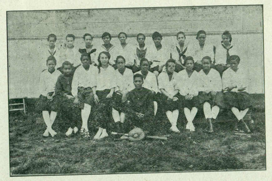
BASEBALL FOR THE GIRLS