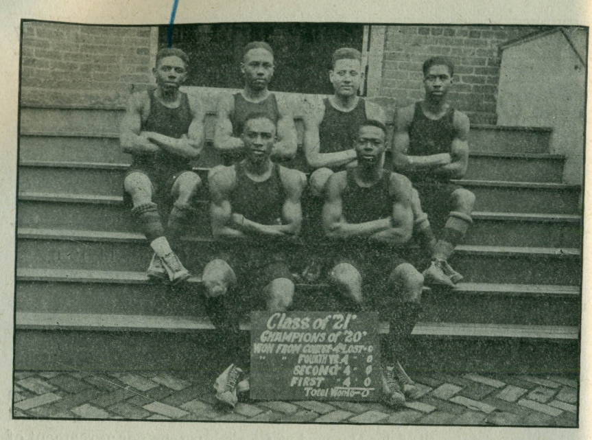
CLASS BASKETBALL CHAMPIONS OF 1919