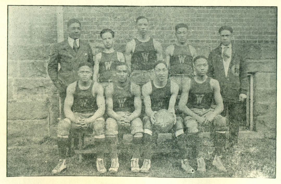
VARSITY TEAM 1921