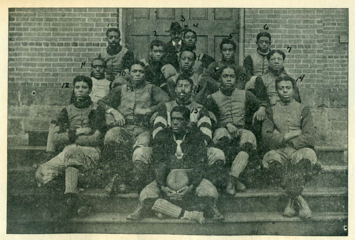
INSTITUTE'S FIRST FOOTBALL TEAM