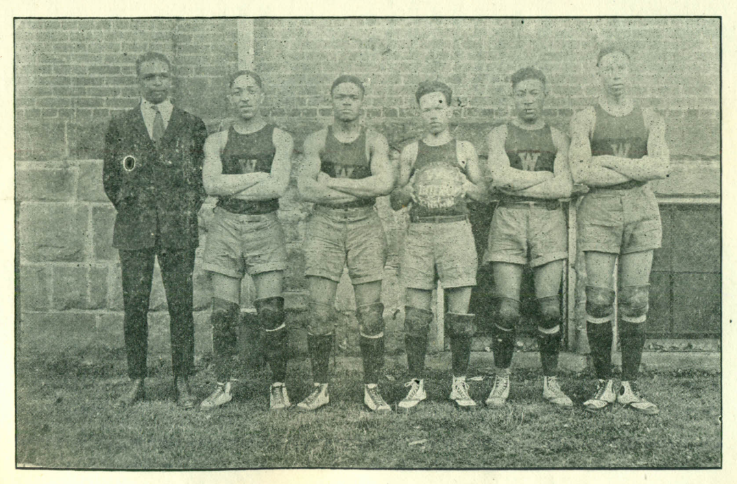
INTERCLASS CHAMPIONS FOR 1921, COLLEGE TEAM