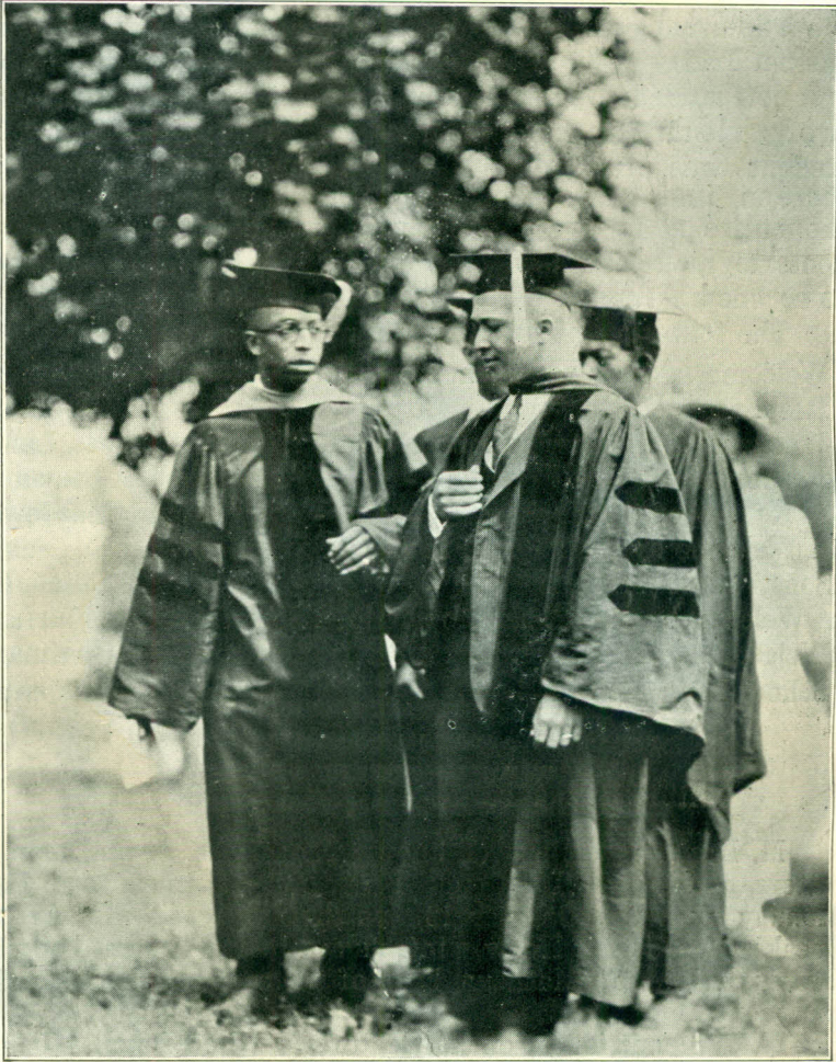
A SCENE AT COMMENCEMENT