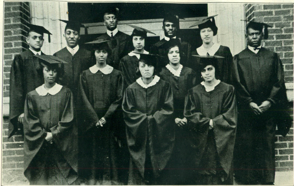
SENIOR COLLEGE CLASS