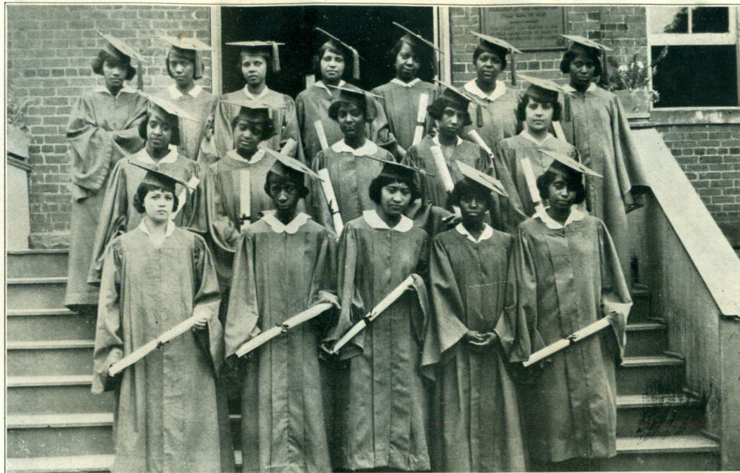
SENIOR NORMAL CLASS