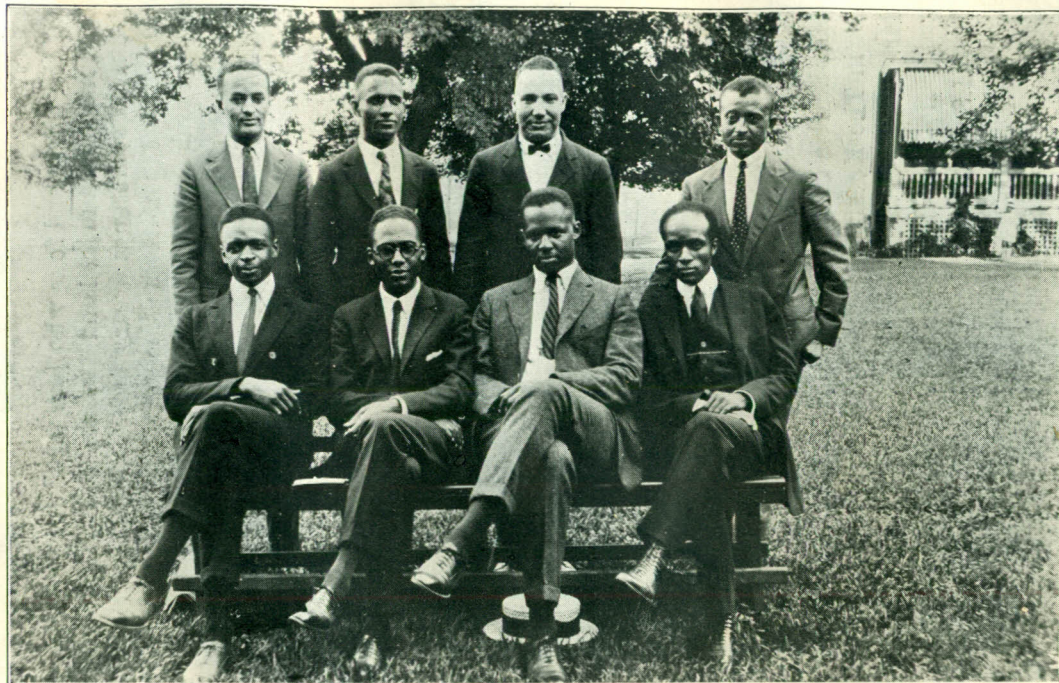
SOME OF THE MALE MEMBERS OF THE FACULTY